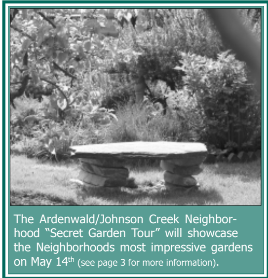
The Ardenwald/Johnson Creek Neighborhood "Secret Garden Tour" will showcase the Neighborhoods most impressive gardens on May 14 th (see page 3 for more information).

Oh, and don't miss our two big events in May: Neighborhood Cleanup Day on Saturday May 7 th from 8:30 a.m. to 1 p.m.;