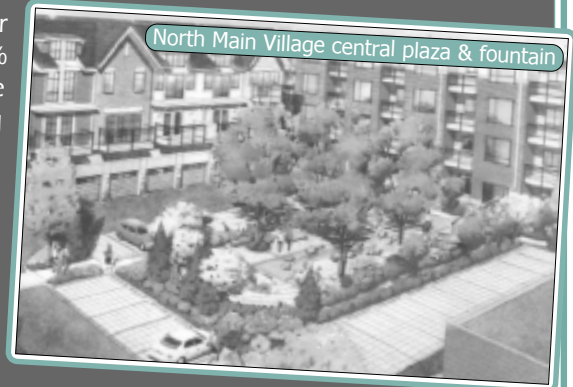
North Main Village central plaza & fountain

Recent renderings of the project generated by the developer, Main Street Partners, LLC, show the buildings will exhibit a variety of architectural styles, spanning from more of a traditional look to the more modern.